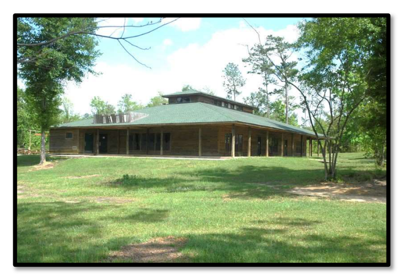
Dining Hall @ Salmen Scout Reservation

It is important for unit leaders to assist the Camp Staff by not allowing their Scouts to leave the Dining Hall until dismissed by the Dining Hall Steward. The Dining Hall Steward will dismiss the table waiters when they have completed their duties. Scout leaders are expected to spread this responsibility among all boys attending Camp. It is a suggestion that your troop's first table waiter be an experienced Scout, to demonstrate the proper methods to